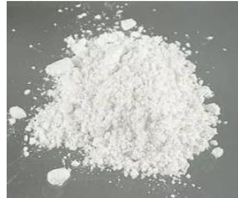
Further processing – Heroin