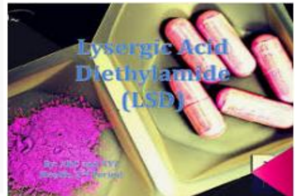
Lysergic acid diethylamide (LSD)