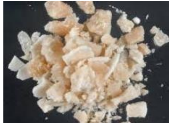
Crack is a kind of cocaine