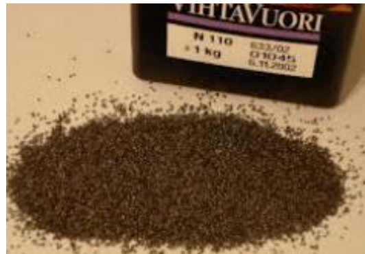
Nitrocellulose smokeless powder