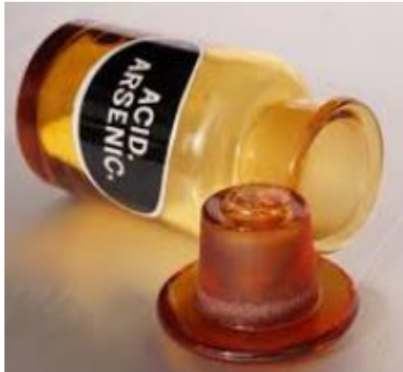
Arsenic acid H 3 AsO 4