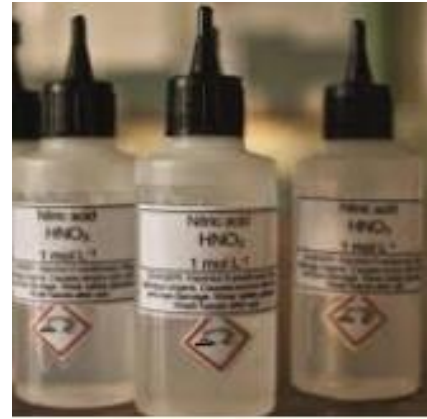
Nitric acid HNO 3